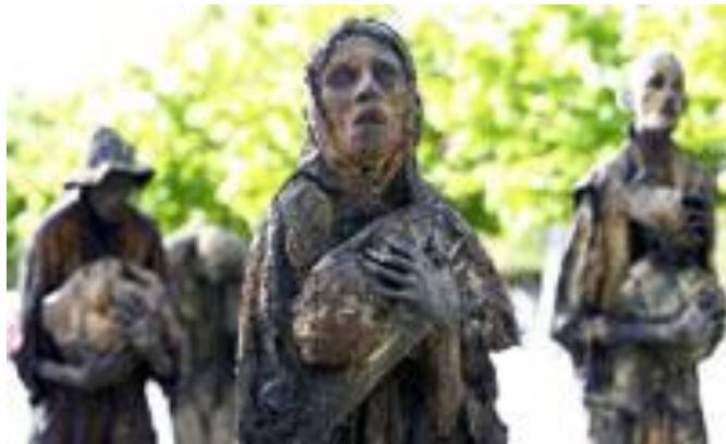
Famine Memorial, Dublin, Ireland

What was the average consumption of potatoes per person in Ireland before the great potato famine of 1845?